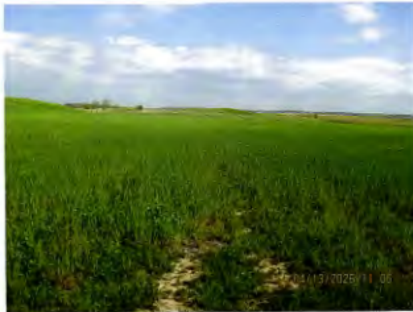
Reclaimed haul road on the Dix property

The haul road between the Schuessler and Dix properties has been re-soiled, mulched and seeded. Vegetation has emerged and appears to be adequately protecting replaced soils.