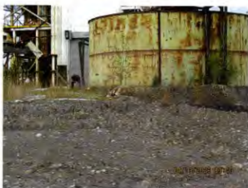
Worker scrapping a floatation tank.