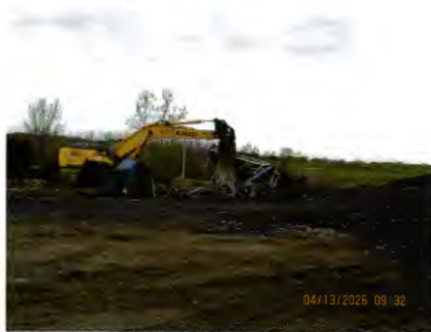
Trackhoe with cutting attachment removing wash plant structure

Work has commenced on the dismantling and disposal of the former wash plant. Two trackhoes were cutting up various metal structures, and several conveyor assemblies have been removed.