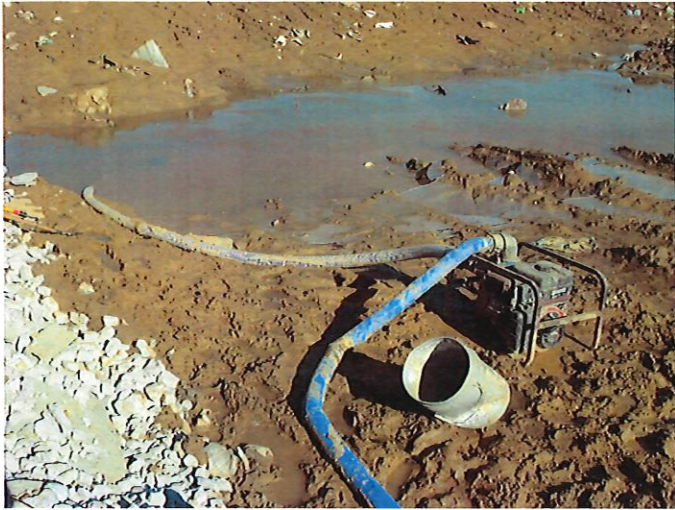
Pooled rain water on uphill side of clogged culvert.