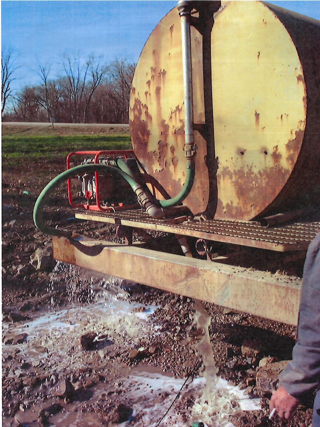
Pumper Truck discharging (approx. 15 feet from Muddy Creek) when health dept arrived.