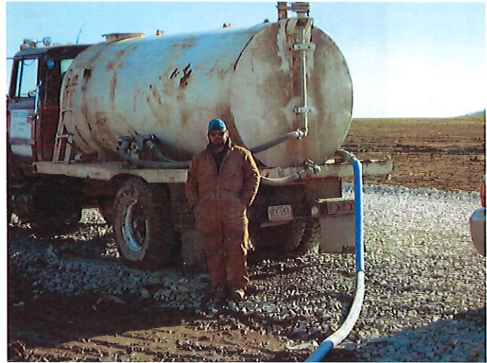
Pumper truck used to pump water.