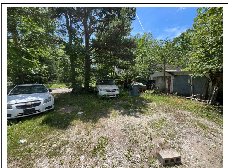
Photo 2: 25-30 waste tires in old shed behind Lane residence which need to be properly disposed.