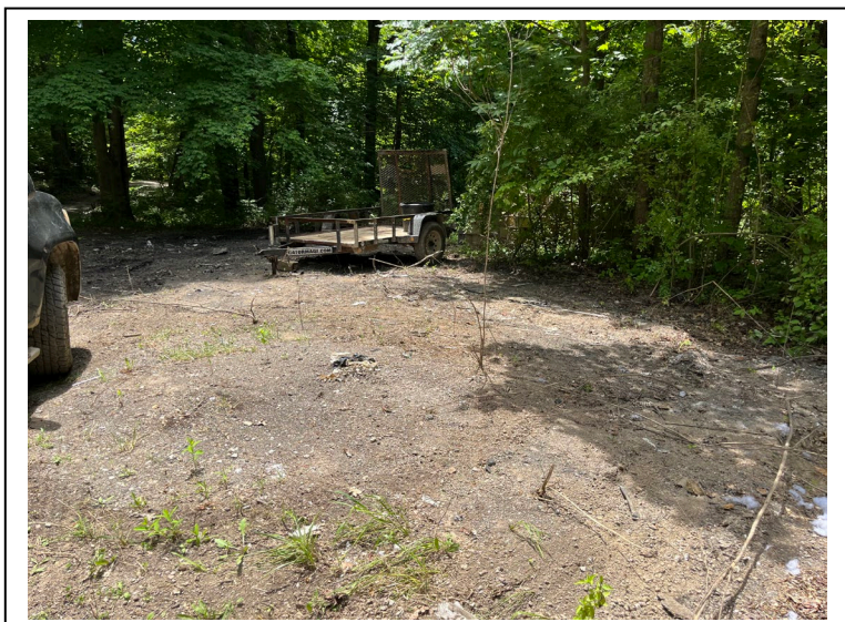
Photo 8: Cleanup of household trash, construction/demolition debris and drywall from area in back of property, close to Michael Moore's house.