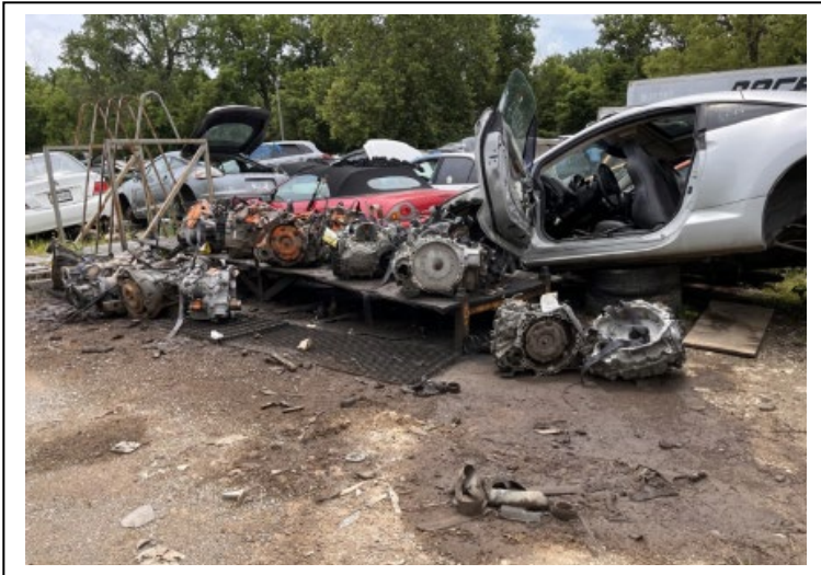
Photo 11 Facility Name: Zore's Inc. Date: June 25, 2024 Others Present: Hunter Pace (IDEM), Jason Abston (Facility) Location & Description: Fluid release and stained soil present near vehicle parts storage.