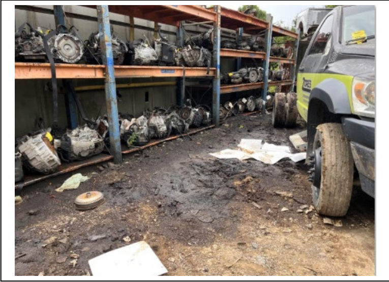
Photo 10 Facility Name: Zore's Inc. Date: June 25, 2024 Others Present: Hunter Pace (IDEM), Jason Abston (Facility) Location & Description: Fluid release and stained soil present near vehicle parts storage.