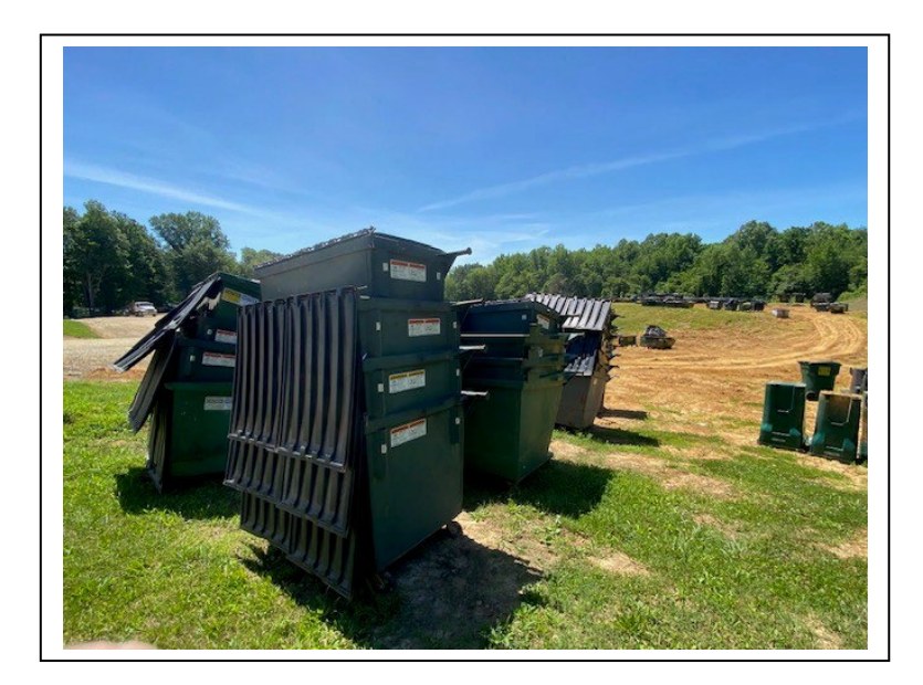
Photo 1. Organized trash toters. Placed upside down to show that they're empty of trash.

Facility NameMarshall Disposal OD, Posey CountyDate/Time6/11/24, 11:08 amOthers PresentMr. GoebelDescription