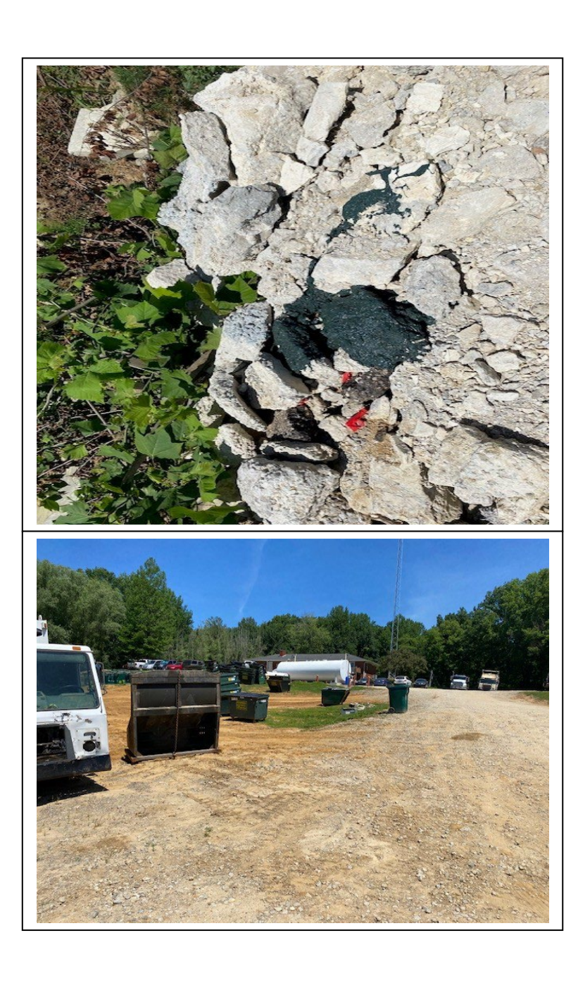
Photo 10. Photo of the edge of the gravel area. Solid waste debris has been cleaned up, and concrete debris remains.

Facility Name Marshall Disposal OD, Posey County Photographer