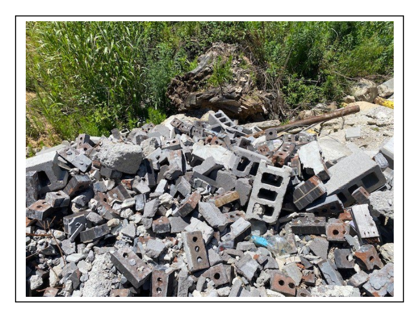
Photo 7. Scrap metals and plastics can be seen mixed with concrete debris on the corner of the gravel area.