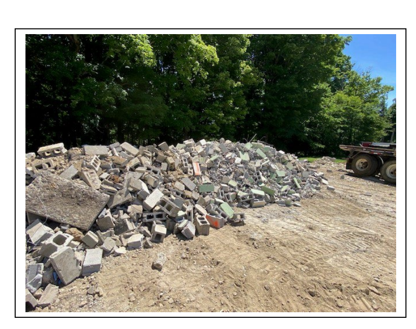
Photo 3. New pile of painted concrete, and cinderblocks that was placed on the property.

Facility NameMarshall Disposal OD, Posey CountyDate/Time6/11/24, 11:11 amOthers PresentMr. GoebelDescription