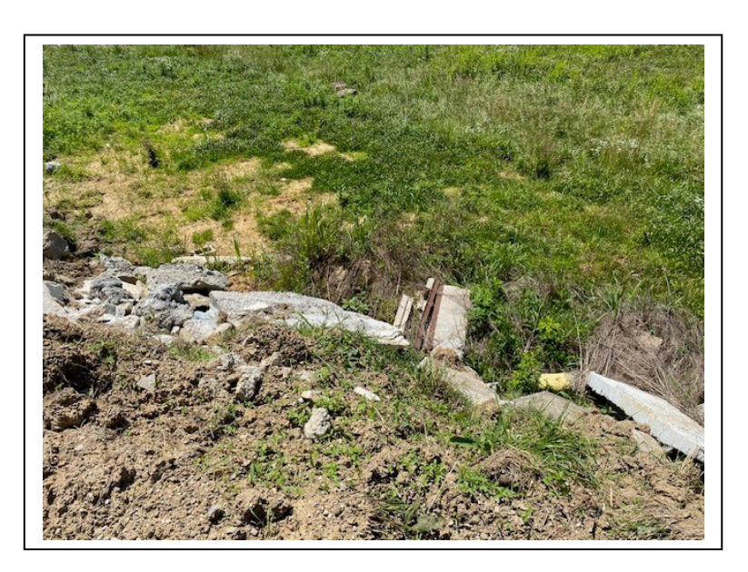
Photo 9. Scrap metals seen in the concrete debris along the gravel area edge.