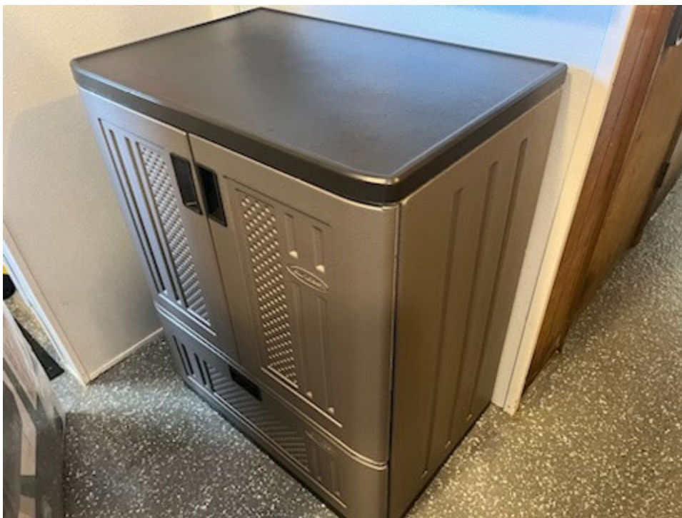
A pressure relief valve has been installed by the bladder tank as recommended.