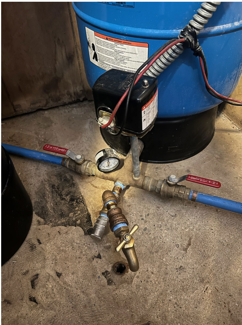
A vacuum breaker has been installed on the outside spigot as requested.